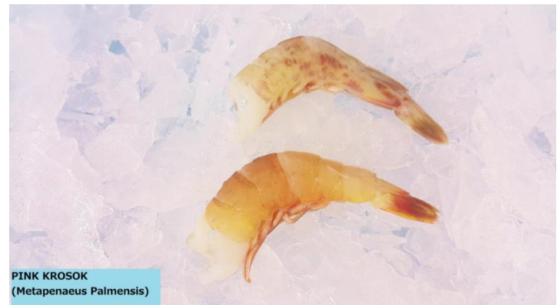
PINK KROSOK ( Metapenaeus Palmensis )